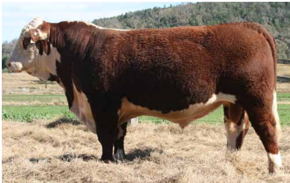
LOT 4 CASCADE ANZAC Q102 (PP)

Notes: Similar type to previous bull. Q102 is a moderate birthweight bull with good growth figures and above average EMA.