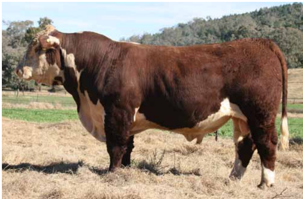
LOT 6 CASCADE LONGFORD Q080 (PP)

Notes: Q080 is from a young Marsala cow showing potential as a good future breeder. A smooth skinned son of Longford with a moderate frame and a high IMF. Top 15% of breed for IMF.