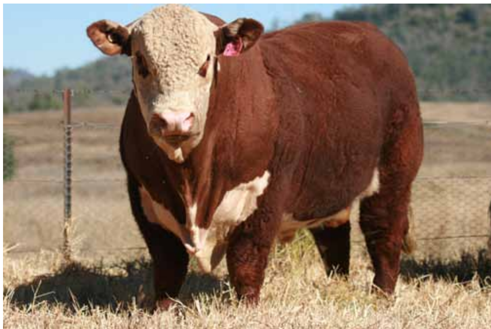
LOT 7 CASCADE MARSHALL Q049 (PP)

Notes: Heifer's first calf. Q049 has thickness and carcass to burn. A moderate framed young sire with an outcross pedigree. Been a favourite of mine since birth for his carcass attributes.