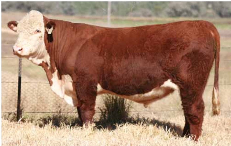
LOT 13 CASCADE ANZAC R004 (PP)

Notes: More of the same. Growth, length and thickness. Top 1% of the breed for growth EBVs.