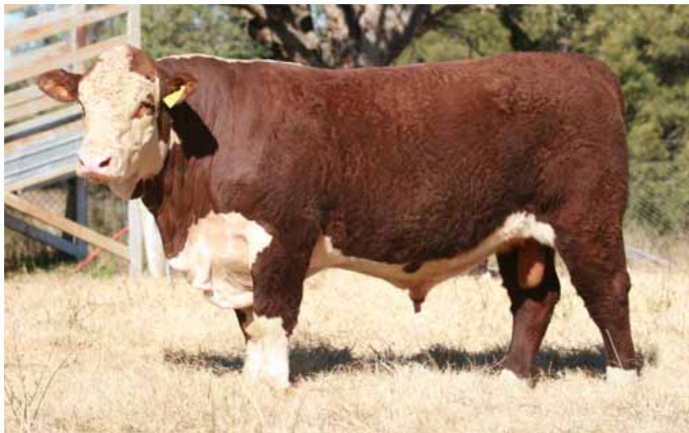
LOT 2 CASCADE MARTY Q098 (PP)

Notes: A bull with extra length and a beautiful soft skin. Depth of body and thickness to boot. From good old cow families in the Advance and Serenade lines. Above average IMF.