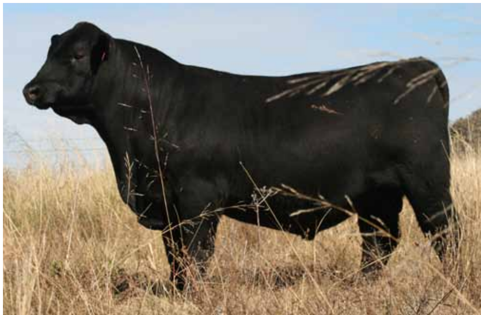
LOT 50 CASCADE MIGHT AND POWER R7SV