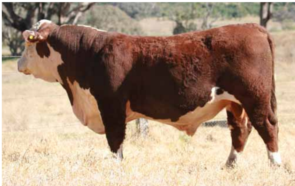
LOT 1 CASCADE ANZAC Q067 (P)

Notes: Q067 a stong and stylish son of L055, showing presence with high growth and EBVs.Carrying a very sound pedigree with the Kerry Maid cow family.