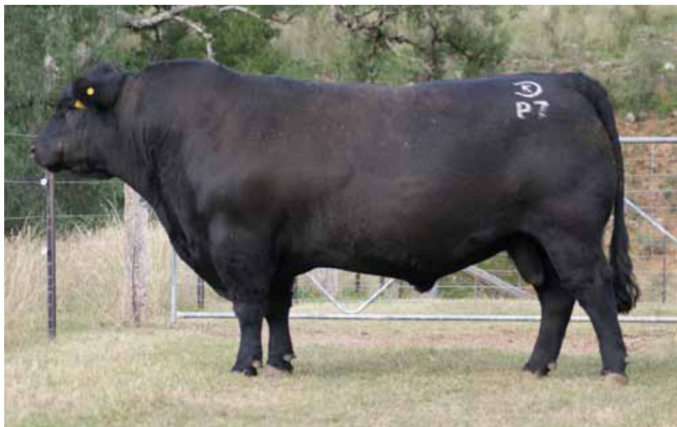
CASCADE COWBOY UP P7 SIRE OF LOTS 57 AND 58