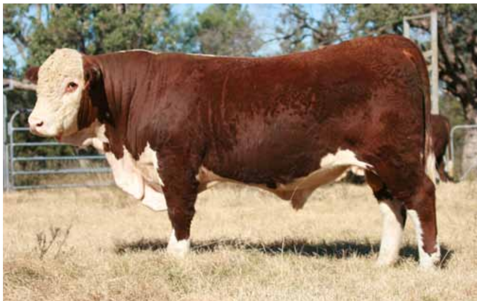
LOT 9 CASCADE ANZAC Q139 (PP)

Notes: Q139 has the same maternal family as previous lot. A stylish young sire with extra length and growth.