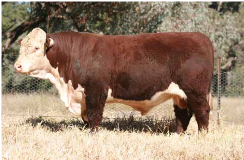
LOT 5 CASCADE LONGFORD Q079 (P)

Notes: Q079 is a soft and easy doing type bull by the Longford sire. First group of females by Longford are milking tremendously. Moderate birthweight bull with good growth and a high IMF. Top 10% of breed for IMF.