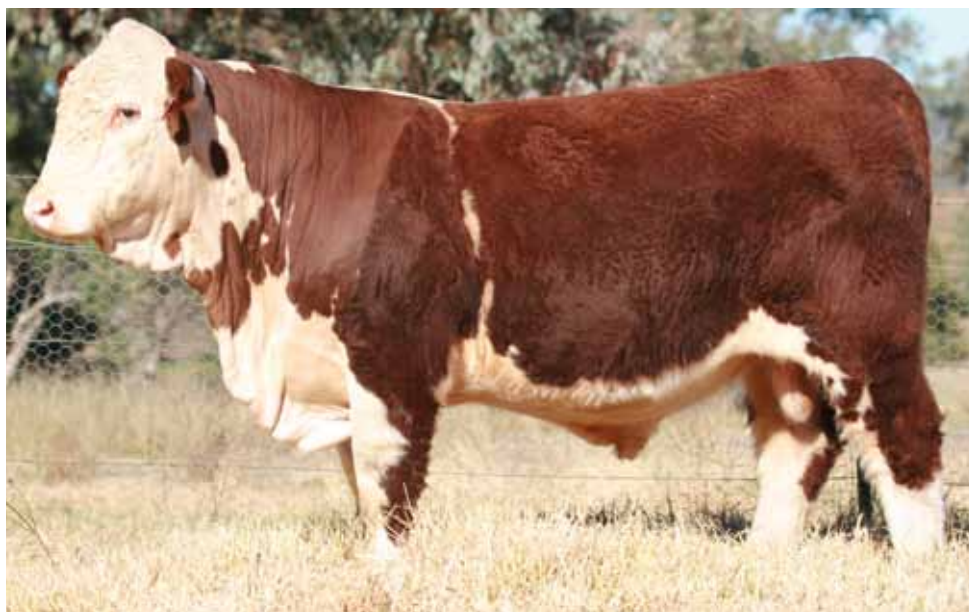
LOT 12 CASCADE ANZAC R011 (PP)

Notes: First of our Autumn bulls. R011 is the full brother to our 2019 sale topper. Sire with length, depth , thickness and balance. A very attractive calf! Top 1% of the breed for all growth EBVs.