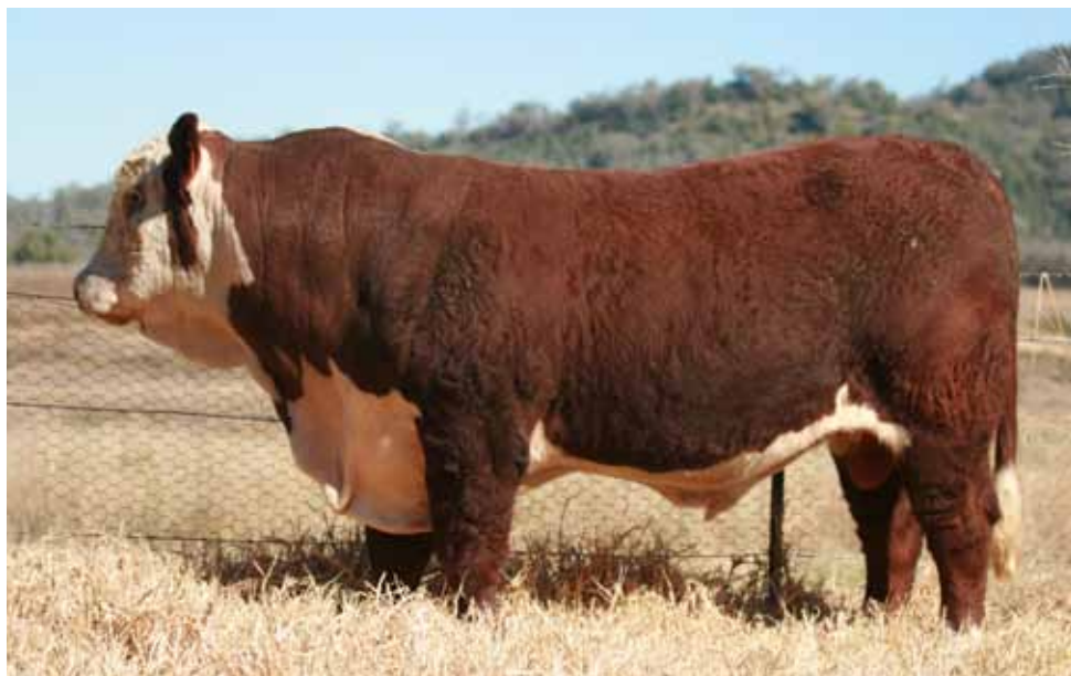
LOT 3 CASCADE ANZAC Q097 (PP)

Notes: Moderate birth weight bull, good growth figures. Long as a train! Top 10% for EMA.