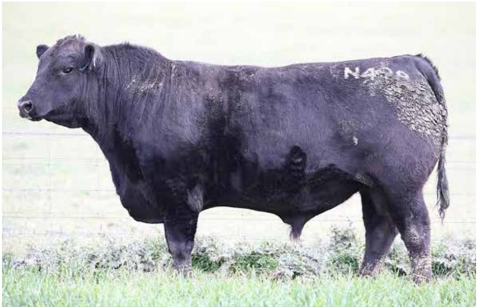
MILWILLAH NAPA N498 SIRE OF LOTS 68, 69, 71 AND 272