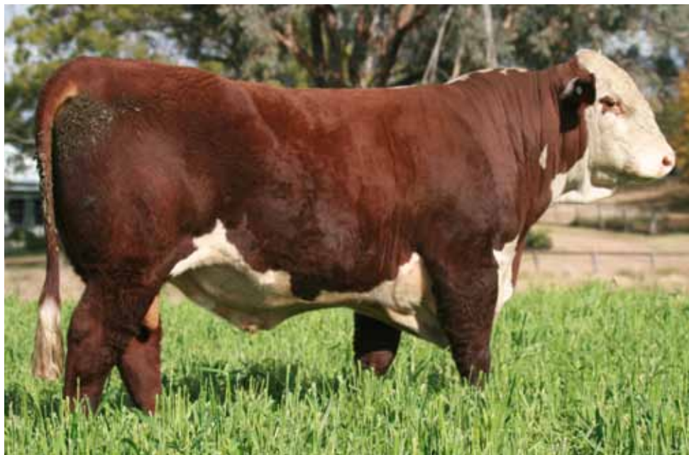
LOT 22 CASCADE MARTY Q088 (S)

Notes: SCURRED. A smooth shouldered son of M097, a terrific EMA to IMF ratio.