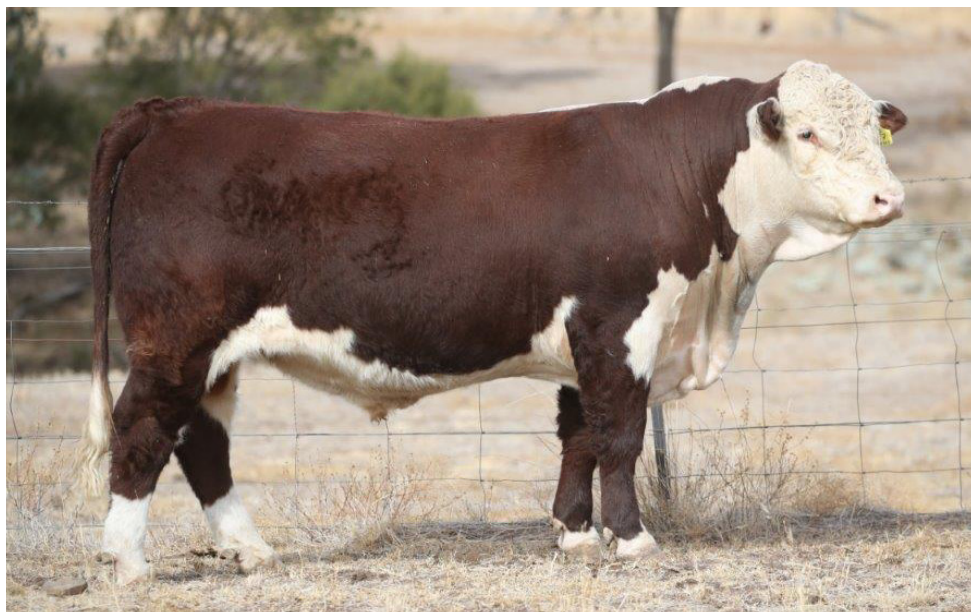
LOT 34 CASCADe MERCY M107 (P)