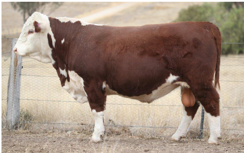
LOT 23 BOBANKEN CENTENNIAL N002 (P)

Notes: A Centennial son out of an old donor cow. This is a growthy free moving young bull with an above average set of EBVs. Top 1% breed for 200, 400 and 600 day weights. Top 15% breed for EMA. Top 10% breed for IMF. Top 5% breed for indexes.