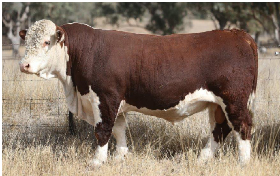
LOT 4 CASCADE MONTE M086 (AI) (S)

Notes: Smooth skinned bull, well balanced and good outlook. From another good Rocky Ned female. Top 5% breed for growth ebvs.