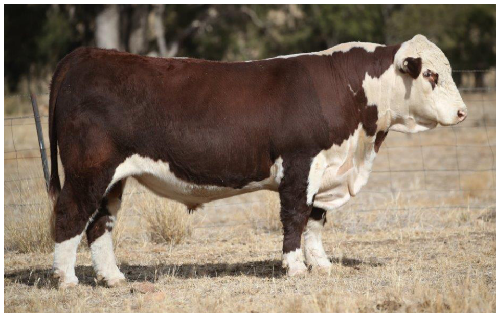
LOT 13 CASCADE MUZZA M098 (P)

Notes: Soft, thick and easy doing bull from a nice K.Union female. M098 shows top carcass attributes combined with a high IMF. Top 10% IMF and Positive Fats.