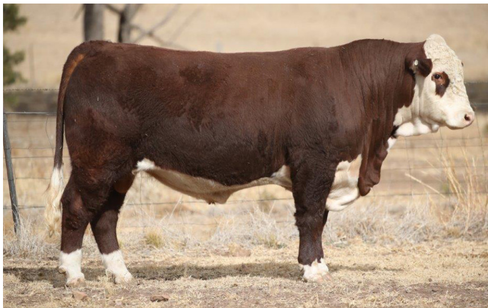
LOT 35 CASCADE MULLET M045 (P)