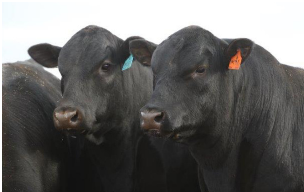
CASCADE BULL SALE 2018 - ANGUS BULLS

Comments: Well grown bull here with lots of natural thickness.