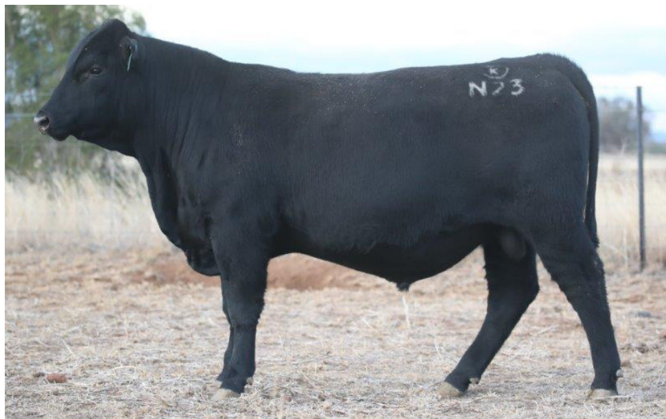
LOT 69 CASCADE JUGIONG N23 (HBR)

Comments: Strong headed son of Jugiong with good structure.