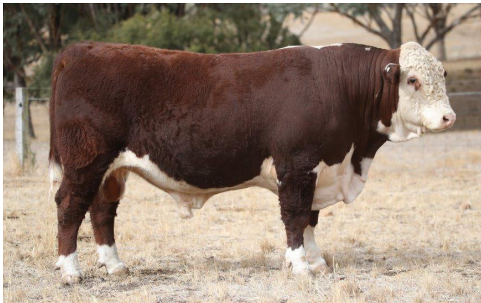
LOT 12 CASCADE COMMERCIAL BULL 57M

Notes: A thick, easy doing commercial bull.