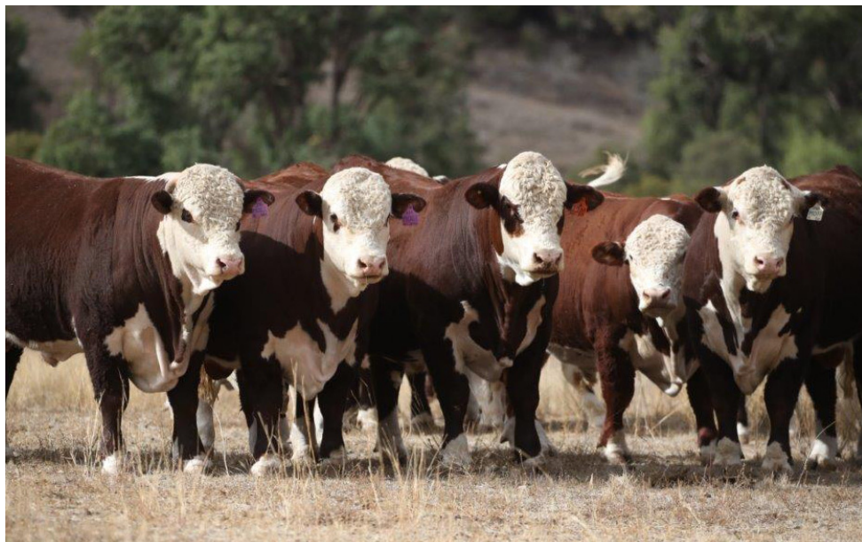
CASCADE BULL SALE 2018 - POLL HEREFORDS

Notes: A moderate frame bull with extra length from the old Irish Maid cow family. Top 10% breed for growth weights. Top 15% breed for EMA.