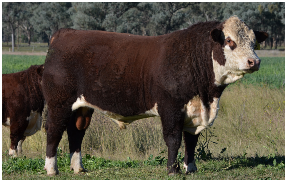
SBDH159 CASCADE REFERENCE SIRE

Notes: Heifers first calf. Deep sided, dark coated son of MV Holbrook. Good calving ease and growth. Above average for all indexes.