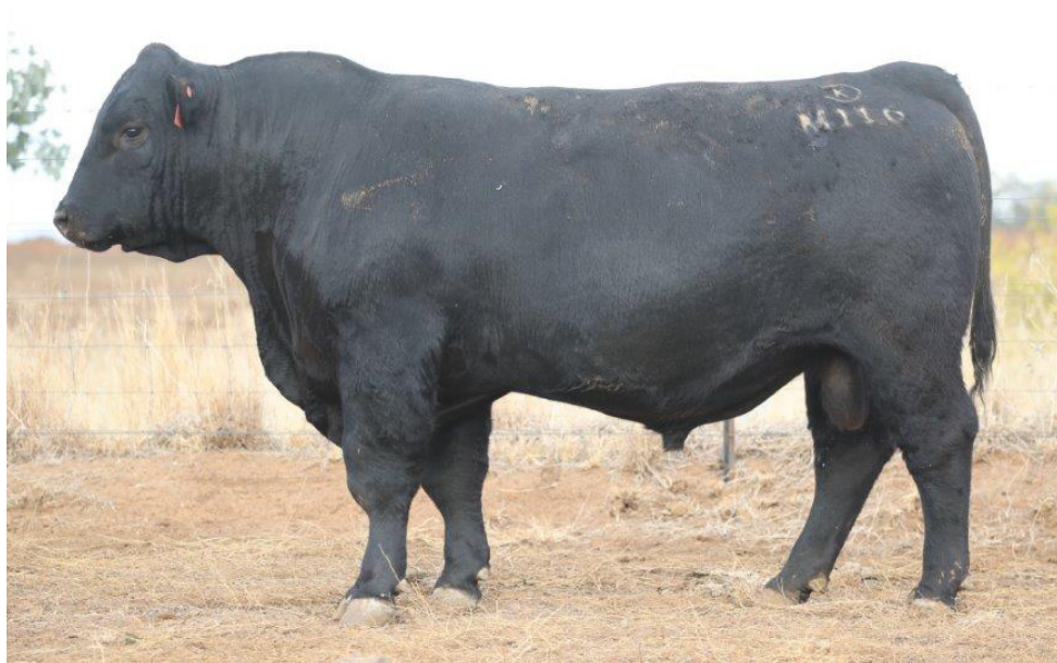
LOT 58 CASCADE MUSTANG M116 (HBR)

Comments: Powerful bull with plenty of bone, highest EMA bull at scanning and has a well rounded set of numbers.