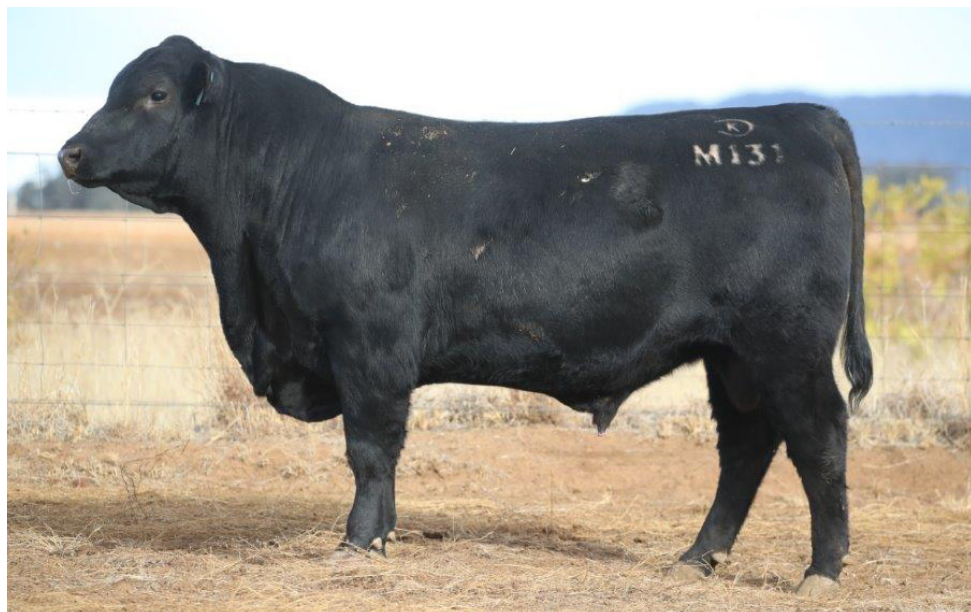
LOT 56 CASCADE MOBY M131 (HBR)

Comments: Very attractive youngster, well balanced and mum was oldest cow in the herd. M131 was the highest scanning IMF bull in March.