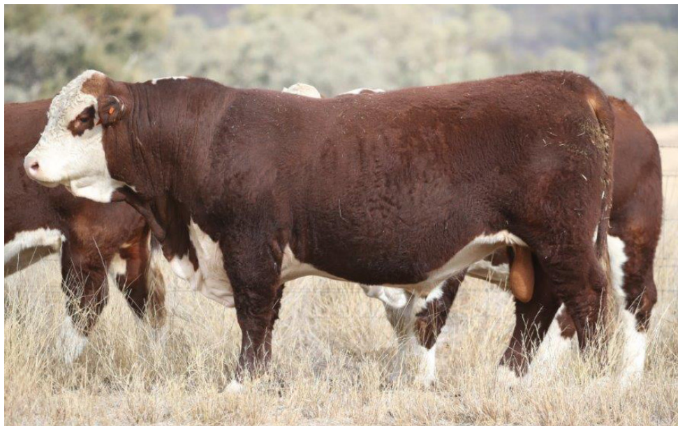
LOT 3 CASCADE MAVERICK M145 (AI) (ET) (P)

Notes: Full brother to previous lot.Real sire appeal. M145 has exceptional length and power to boot. Top 10% breed for all growth ebvs.