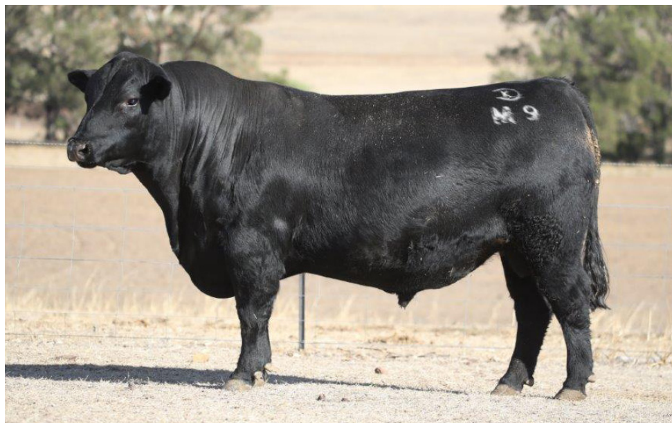
LOT 42 CASCADE MORGAN M9 (AI) (HBR)

Comments: M9 was retained last year and used in our Autumn and Spring program as a backup bull over heifers and cows, calves were born easy and look to grow well. By the great Ardrossan Equator A241 with lots of growth and high carcase weight.