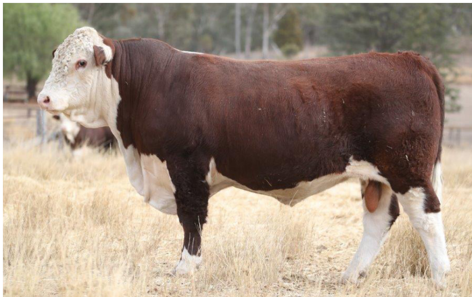
LOT 5 BOBANKEN MARLIN M014 (AI) (P)

Notes: This bull has a good depth of body, is smooth shouldered and is a nice type. One of only two bulls in sale by MTTH34. Top 1% breed for 200, 400 and 600 day weight.