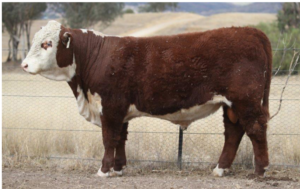
LOT 24 CASCADE ADVANCER N009 (P)

Notes: A good strong reliable bull with high growth and extra length. Top 20% breed for EMA.