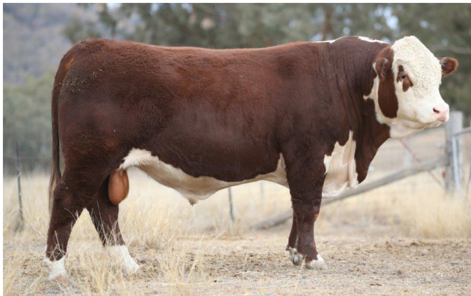
LOT 2 CASCADE MATRIX M152 (AI) (ET) (P)

Notes: One of the younger bulls of the draft showing extra length and carcase.Strong sires head and outlook. H88 is a good Rocky Ned female. Dam has been used as a donor.