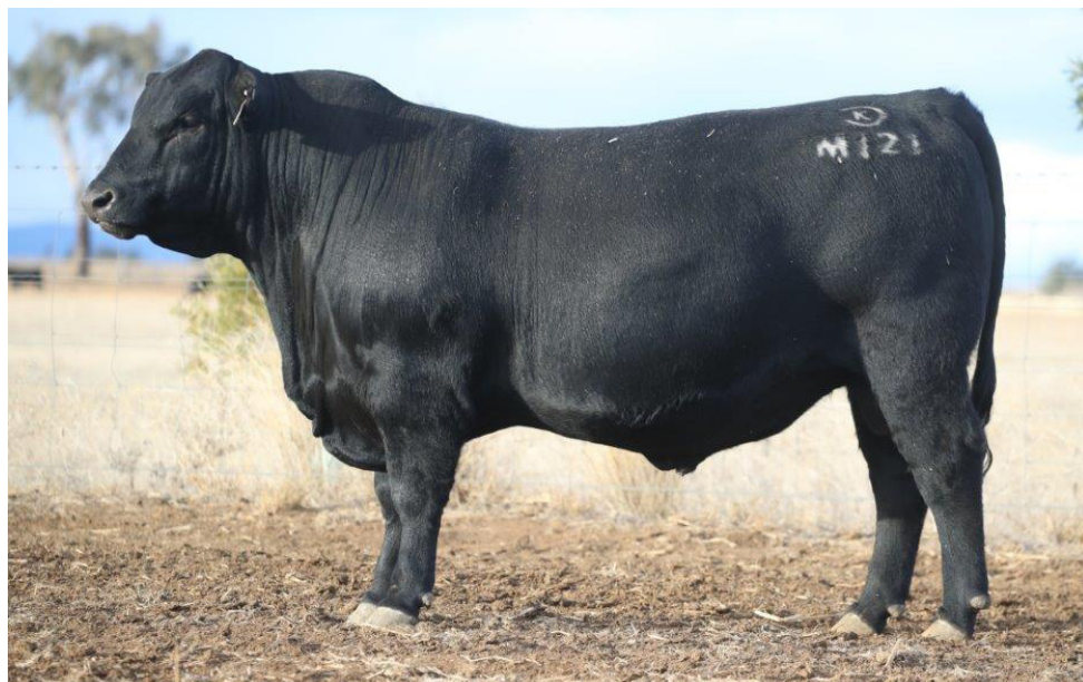
LOT 50 CASCADE MATRIX M121 (HBR)

Comments: Long smooth, easy doing bull with great feet. Scanned well with a big EMA and high IMF