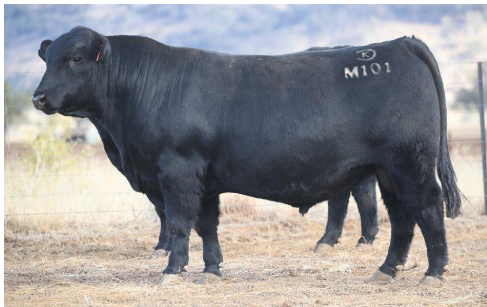
LOT 48 CASCADE MONTY M101 (AI) (HBR)

Comments: Trademark Braveheart of Stern bull here, great structure with a lot of EMA.