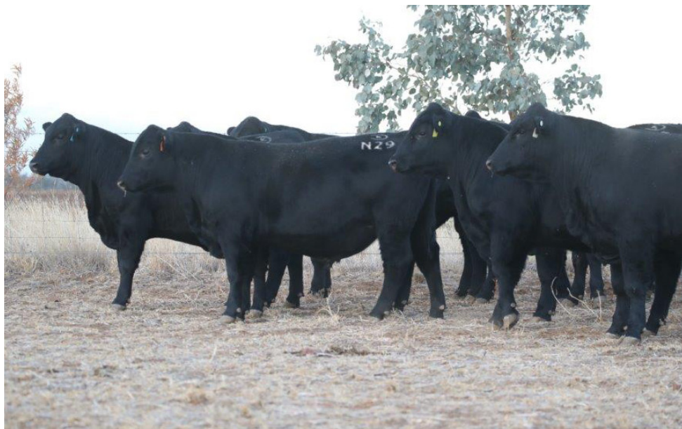
CASCADE BULL SALE 2018 - ANGUS BULLS

Comments: Long sided young bull with good growth. Below average birth and short gestation.