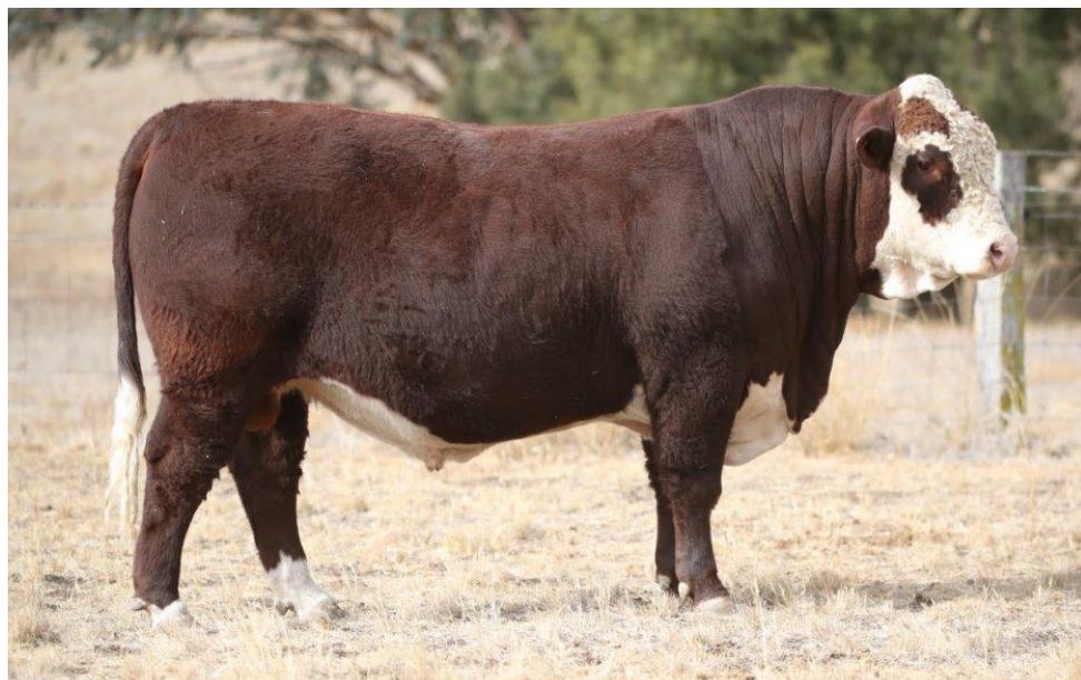
LOT 15 CASCADE MORGAN M026 (P)

Notes: Heifers first calf. Moderate birth weight, positive calving ease. A well balanced bull with extra depth and thickness.