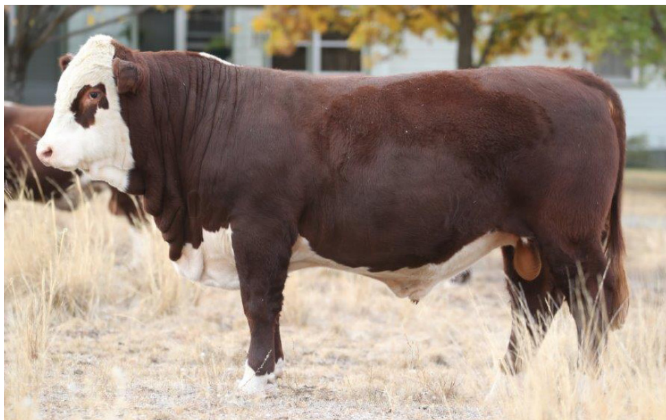
LOT 26 CASCADE CENTENNIAL N011 (AI) (P)

Notes: Another Centennial son with thickness and carcase attributes we all need. Top 5% breed for Indexes and IMF. Top 5% breed for 200, 400 and 600 day weights. Top 10% breed for EMA combined with a moderate birth.