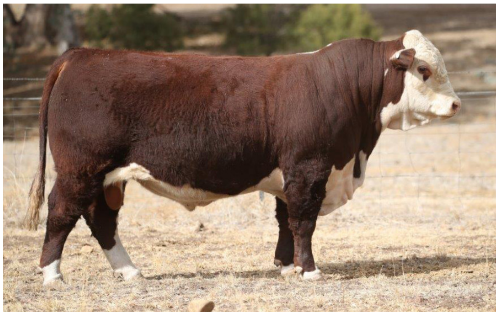
LOT 18 BOBANKEN MARKSMAN M007 (S)

Notes: Heifers first calf. Another Holbrook son, moderate birth and good calving ease EBVs . Thick and deep.