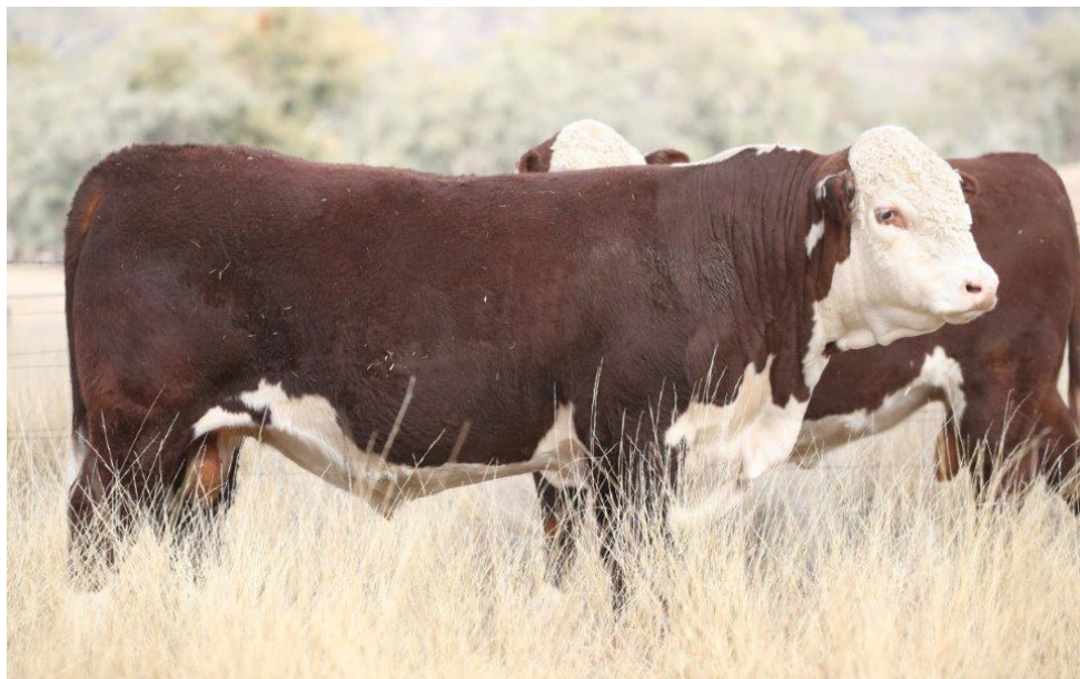
LOT 1 CASCADE MILO M089 (P)

Notes: An easy doing son of Days Destiny to start the sale.A soft skinned bull with exceptional thickness. Dam has been used as a donor.