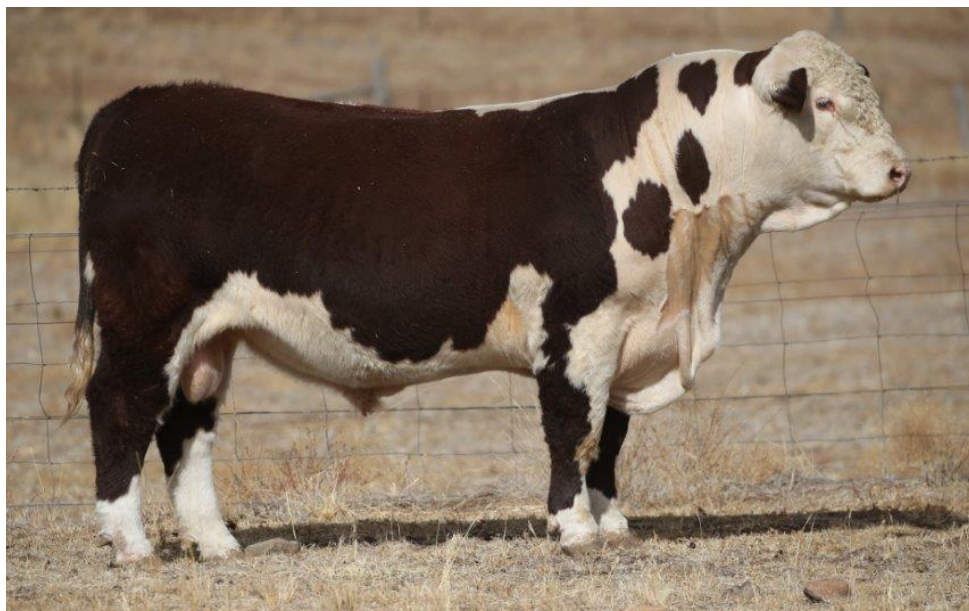
LOT 11 BOBANKEN MASTER M013 (P)

Notes: A strong reliable bull with above average growth showing plenty of carcass. Top 15% breed for 200, 400 and 600 day weights.