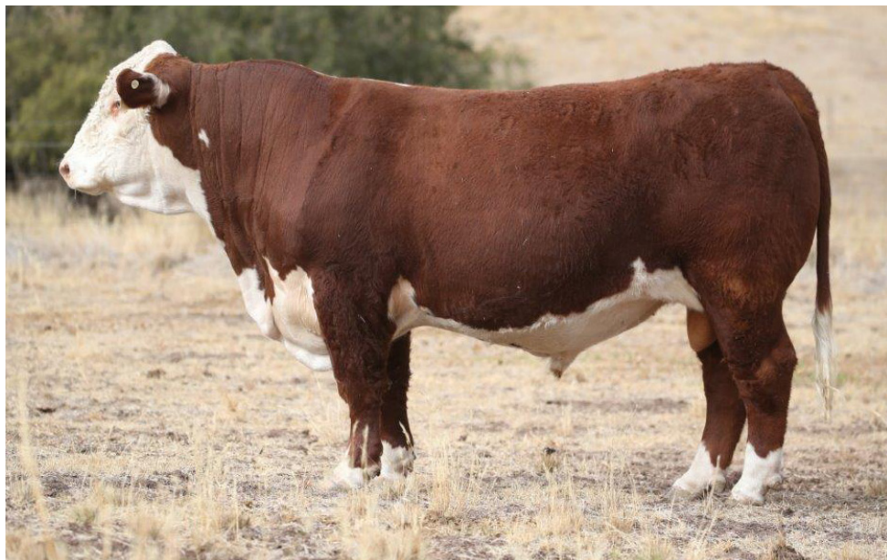
LOT 16 CASCADE MOHAWK M064 (AI) (P)

Notes: A good light birthweight son of Hometown 10Y.Great carcase shape. A magnificent set of data figures.