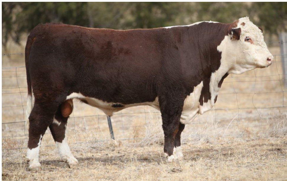
LOT 31 CASCADE MARTINI M077 (AI) (P)