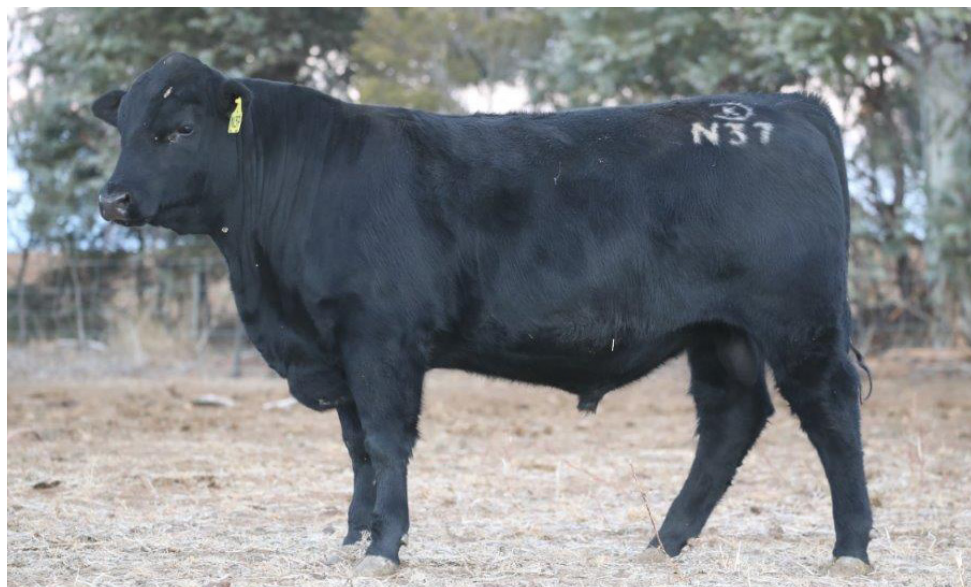
LOT 66 CASCADE JUGIONG N37 (HBR)

Comments: First of the yearling bulls, maternal brother to last years top priced yearling. H110 is doing a fantastic job in the Autumn program and has again produced a cracking heifer calf. N37 is very well made and shows plenty of natural thickness. Equal highest IMF yearling at March scanning, good spread of birth to 600 day growth.